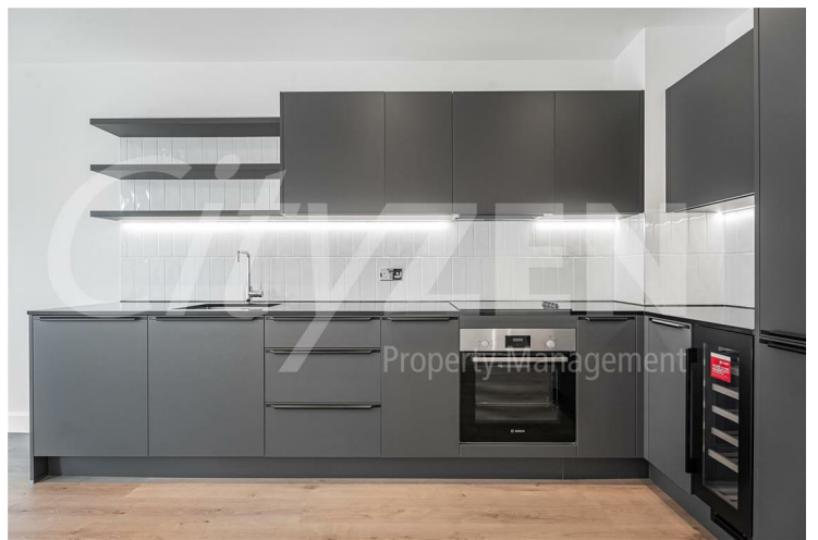
KITCHEN (PHOTO OF A SIMILAR APARTMENT)