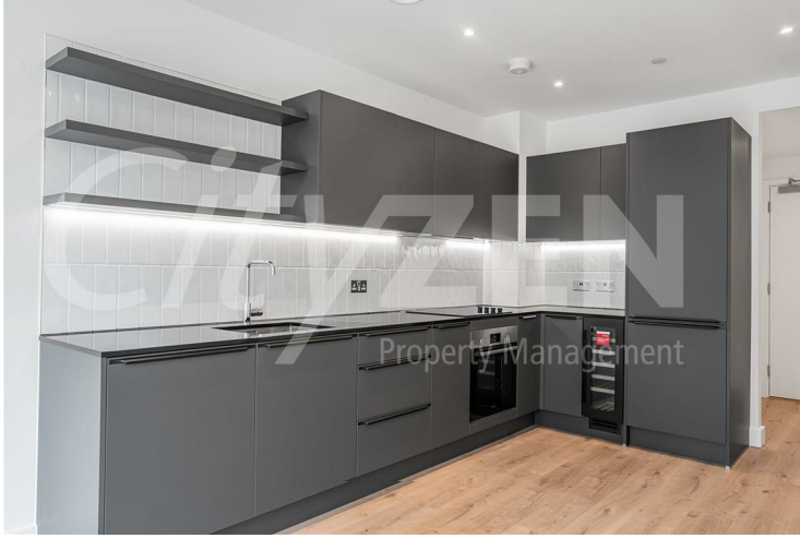
KITCHEN (PHOTO OF A SMILAR APARTMENT)