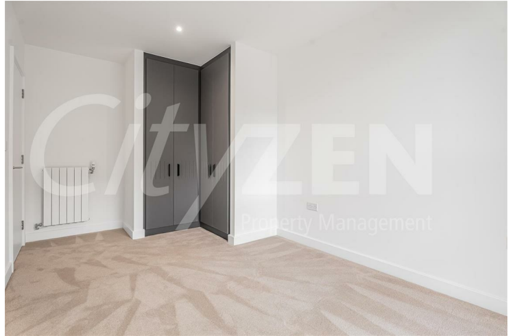
BEDROOM (PHOTO OF A SMILAR APARTMENT)