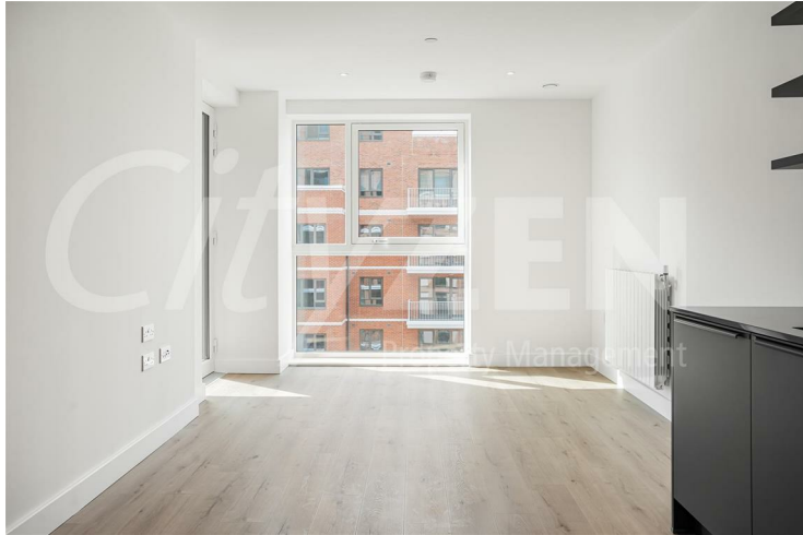
RECEPTION (PHOTO OF A SIMILAR APARTMENT)