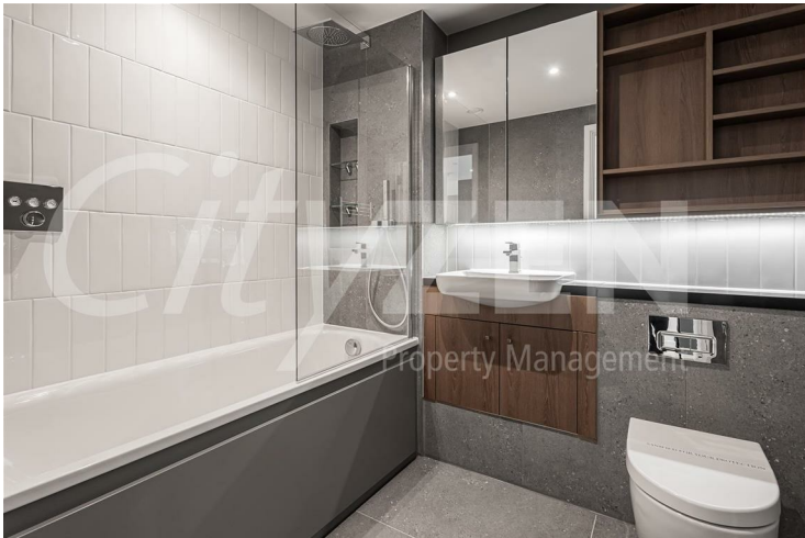
BATHROOM (PHOTO OF A SMILAR APARTMENT)