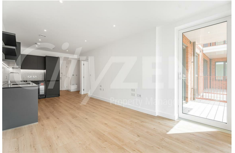
RECEPTION (PHOTO OF A SIMILAR APARTMENT)