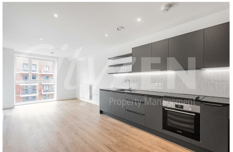
KITCHEN (PHOTO OF A SIMILAR APARTMENT)