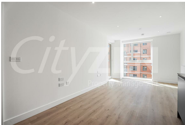
RECEPTION (PHOTO OF A SIMILAR APARTMENT)