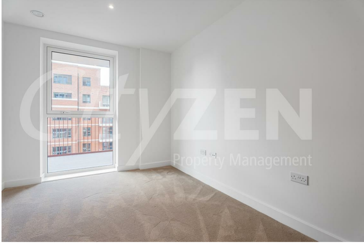
BEDROOM (PHOTO OF A SIMILAR APARTMENT)