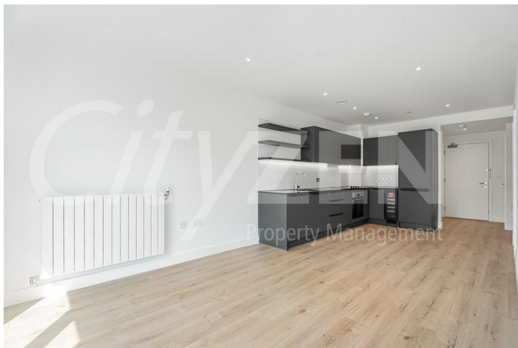
RECEPTION (PHOTO OF A SIMILAR APARTMENT)