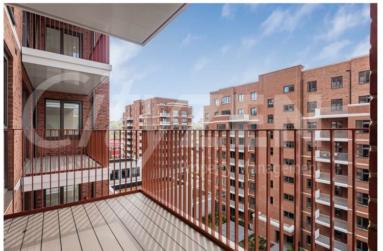
BALCONY (PHOTO OF A SIMILAR APARTMENT)