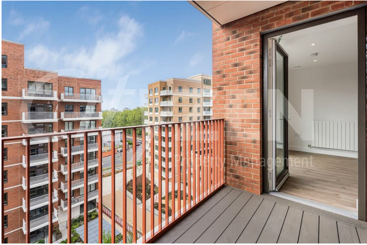
BALCONY (PHOTO OF A SMILAR APARTMENT)