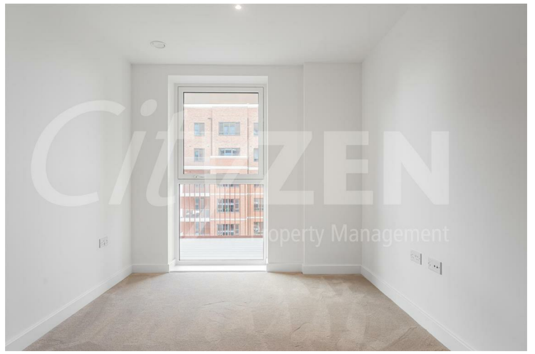
BEDROOM (PHOTO OF A SMILAR APARTMENT)