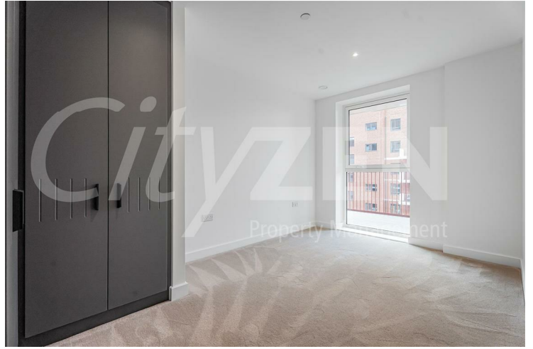
BEDROOM (PHOTO OF A SMILAR APARTMENT)